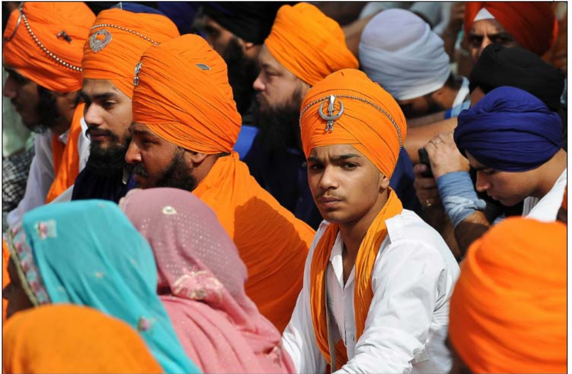
10 Members of Rome's Sikh community protest proposals in several countries that could lead to the outlawing of the turban, an integral part of Sikh identity. The protest, on Sept. 25, was one of a string of similar demonstrations in European capitals. #